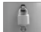
L08 – Channell Padlock & Hex Self-Locking System