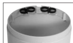
A04 – Drop Wire Organizer (Shipped Separately)