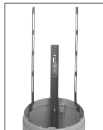
B8 – MB-8522 (2 ea.)