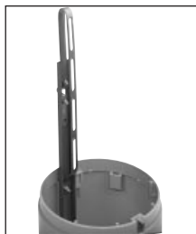
B1 – MB-8468