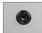
L07 – Threaded Lock Option with Shield (Less Lock) & Hex Head Self-Locking System