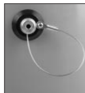
L90 – Highfield Lock with Steel Tether & Hex Self-Locking System