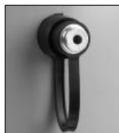
L09 – Highfield Lock with Plastic Tether & Hex Self-Locking System