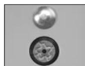
L01 – Standard Self-Locking System