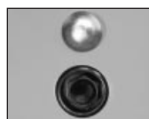
L00 – Hex Self-Locking System