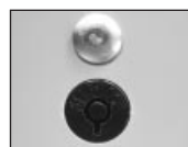
L01 – Standard Self-Locking System