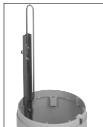
B2 – MB-8467